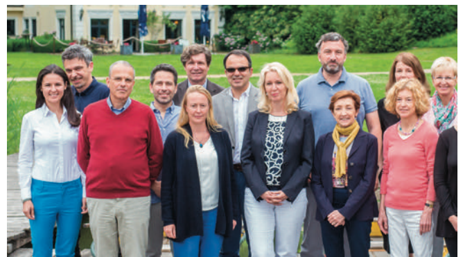
The weather was on our side: Seminar 22’s group out on the dock of Lake Madlitz.